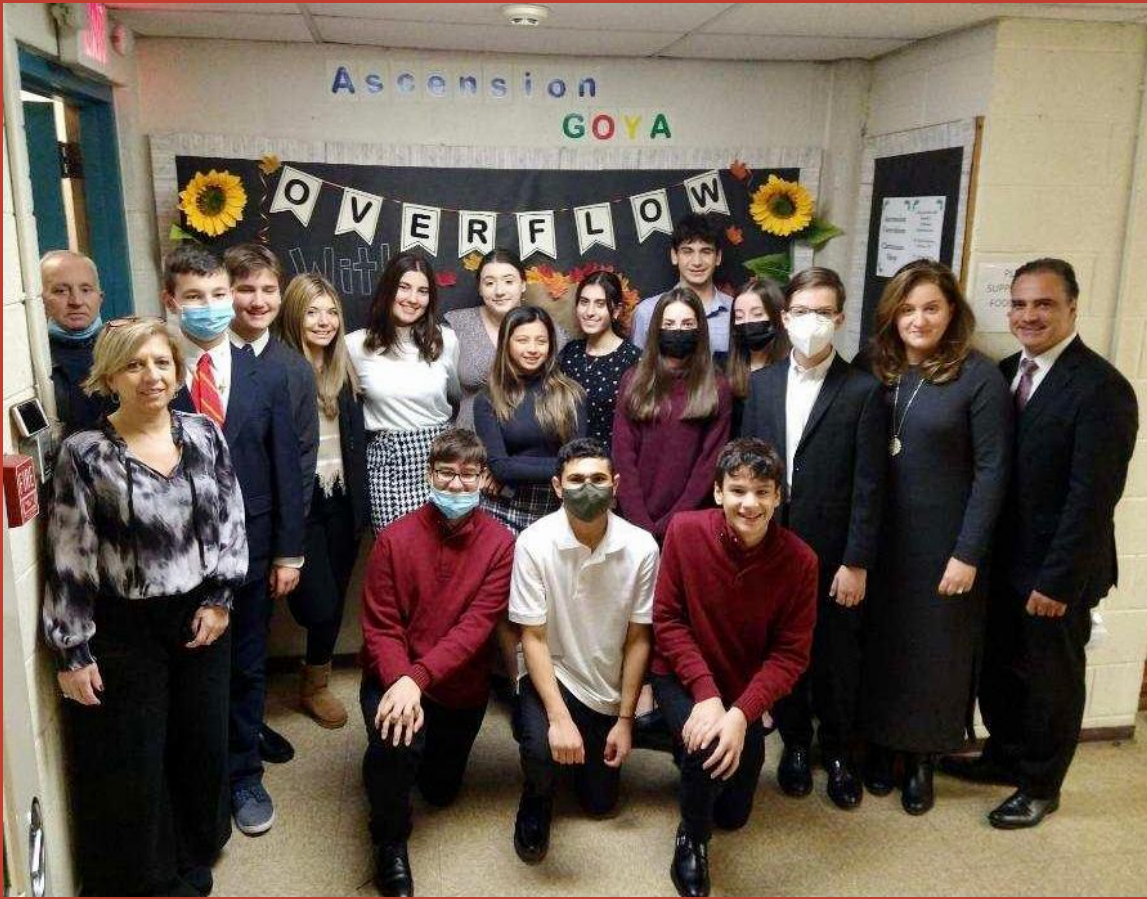
The Ascension GOYA (Greek Orthodox Youth of America) serve our church on Sunday, November 28, 2021.