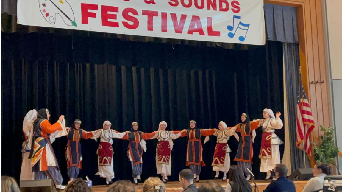
GREEK DANCE GROUP