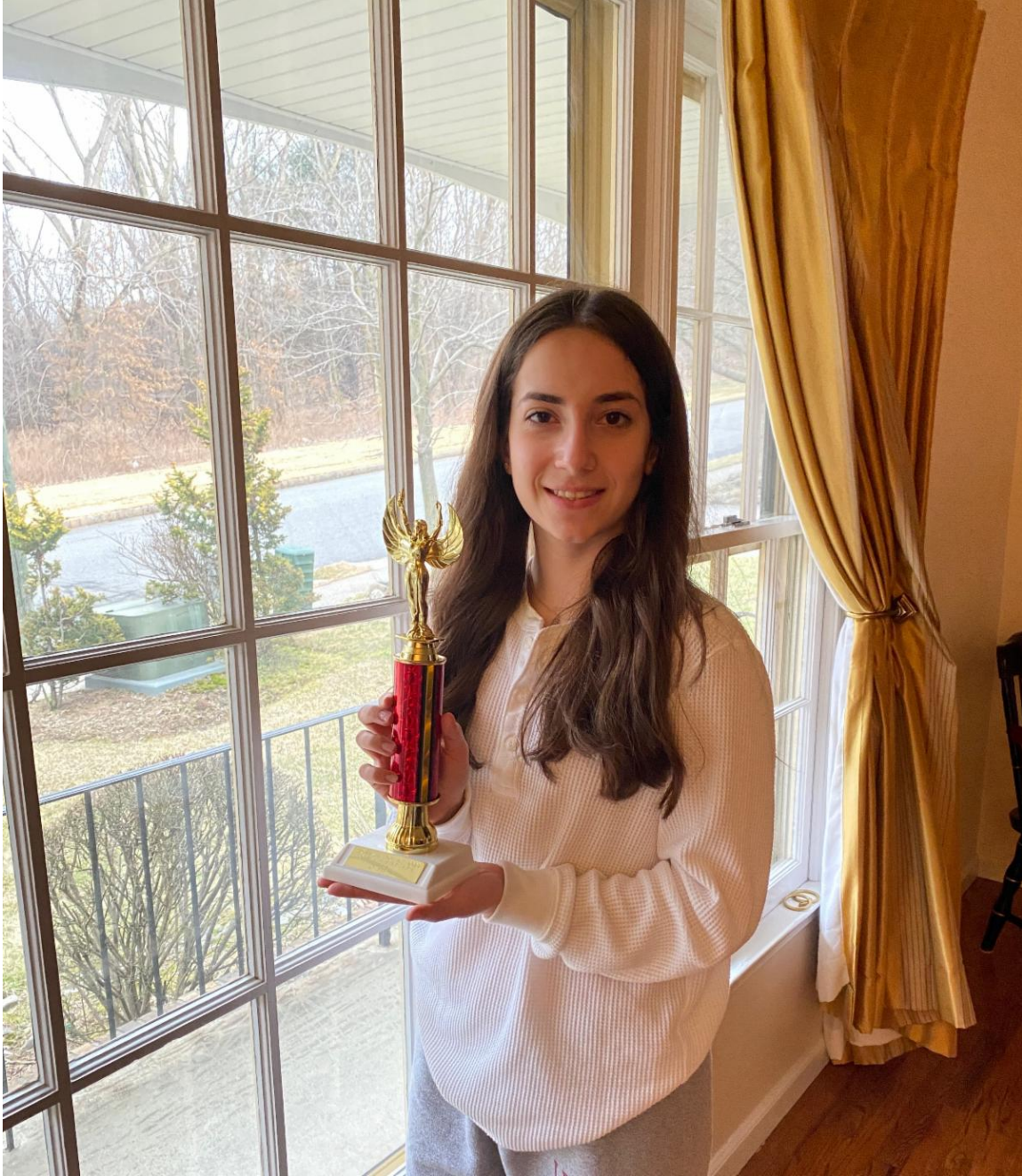
COLLAGE ART, Sophia Lazarou ~ 2nd Place