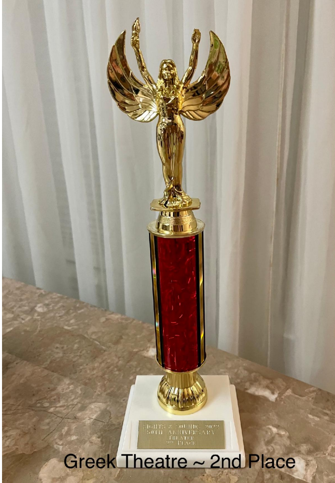
Greek Theatre ~ 2nd Place