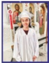
Sofia Vergara Σοφία Βεργάρα