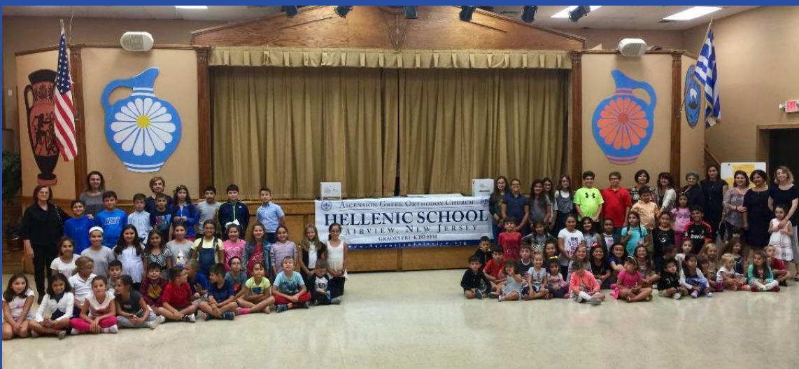
YEAR 2017 ASCENSION GREEK SCHOOL 10th Anniversary of Jr. High School Gymnasio 7, 8, & 9