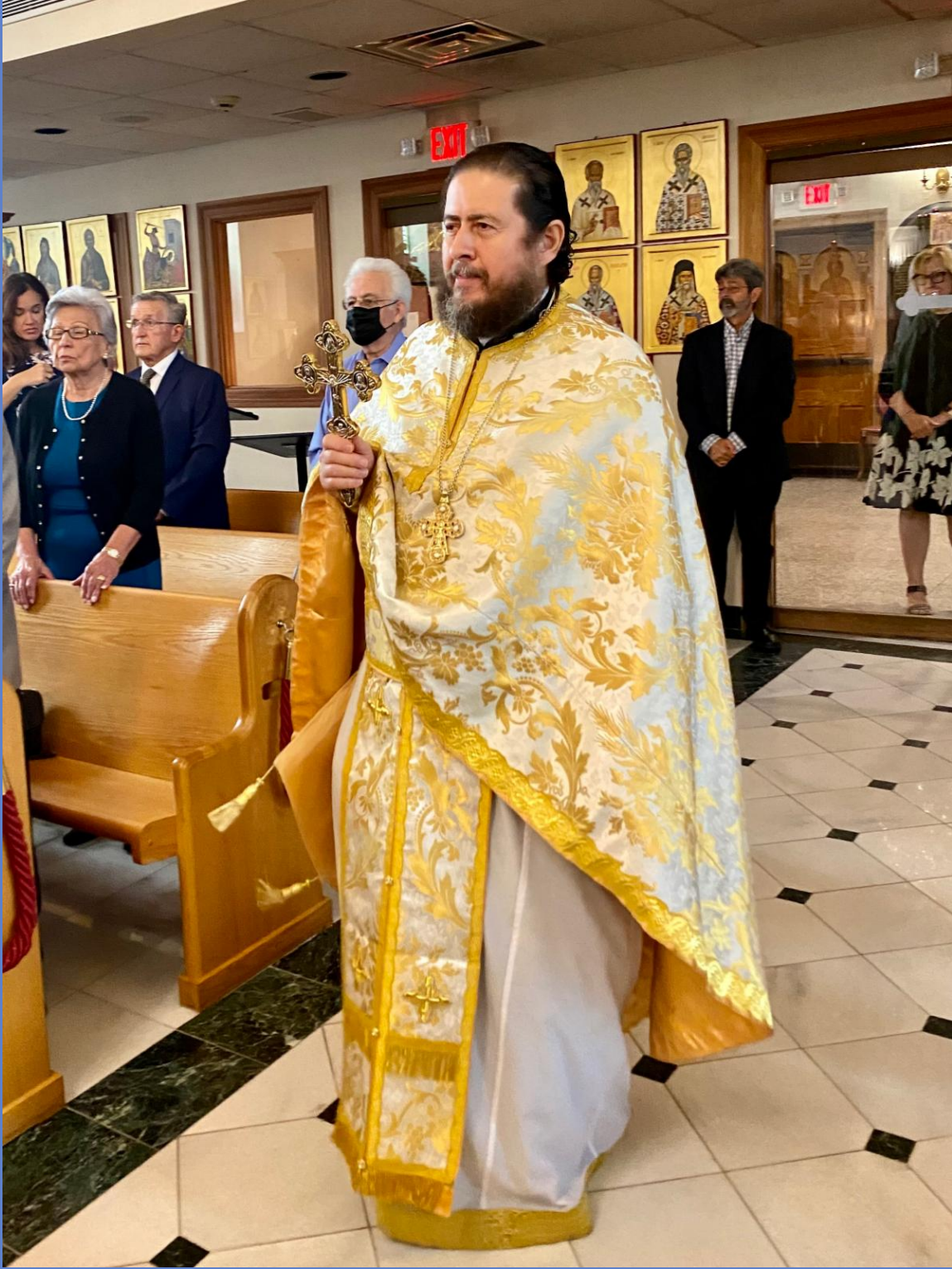
GREEK SCHOOL GRADUATION