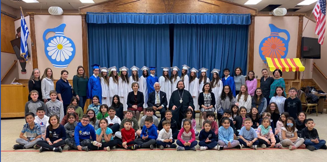
YEAR 2022 ASCENSION GREEK SCHOOL 15th Anniversary of Jr. High School Gymnasio 7, 8, & 9