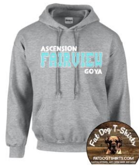
GOYA ASCENSION FAIRVIEW HOODIE- SPORT GREY