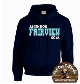
GOYA ASCENSION FAIRVIEW HOODIE- NAVY