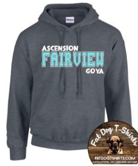
GOYA ASCENSION FAIRVIEW HOODIE- CHARCOAL HEATHER