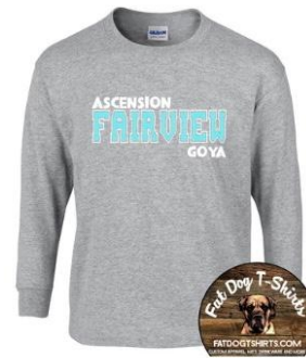
GOYA ASCENSION FAIRVIEW-LONG SLEEVE-SPORT GREY