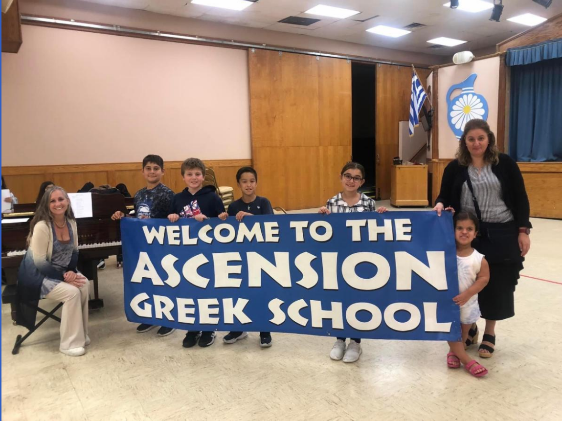
On October 5, 2022, The Ascension Greek School honored our teachers on Global Teacher Day.