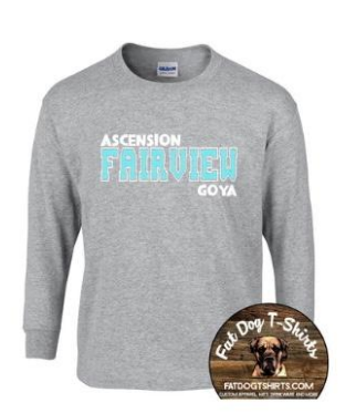
GOYA ASCENSION FAIRVIEW-LONG SLEEVE-SPORT GREY