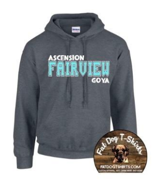
GOYA ASCENSION FAIRVIEW HOODIE-CHARCOAL HEATHER