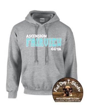
GOYA ASCENSION FAIRVIEW HOODIE-SPORT GREY