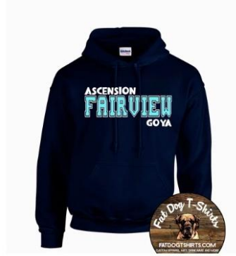
GOYA ASCENSION FAIRVIEW HOODIE- NAVY