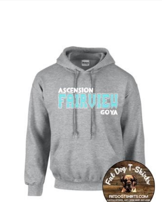
GOYA ASCENSION FAIRVIEW HOODIE- SPORT GREY