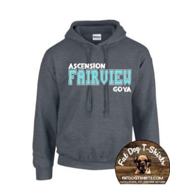
GOYA ASCENSION FAIRVIEW HOODIE- CHARCOAL HEATHER