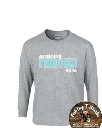
GOYA ASCENSION FAIRVIEW-LONG SLEEVE-SPORT GREY