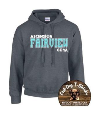
GOYA ASCENSION FAIRVIEW HOODIE-CHARCOAL HEATHER