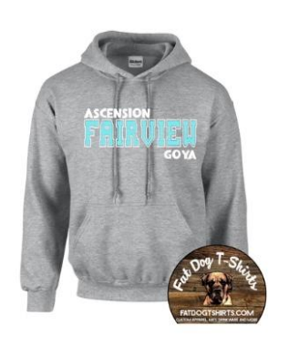
GOYA ASCENSION FAIRVIEW HOODIE-SPORT GREY