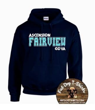
GOYA ASCENSION FAIRVIEW HOODIE-NAVY