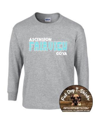
GOYA ASCENSION FAIRVIEW-LONG SLEEVE-SPORT GREY