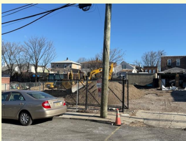
Parking Lot Day 2