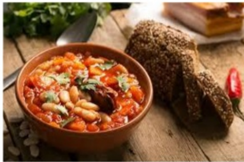
«KALI SARAKOSTI», «Καλή Σαρακοστή»