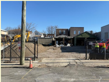
Parking Lot Day 1